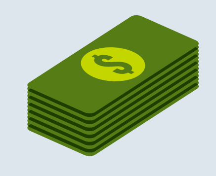
Pay your bills on time.